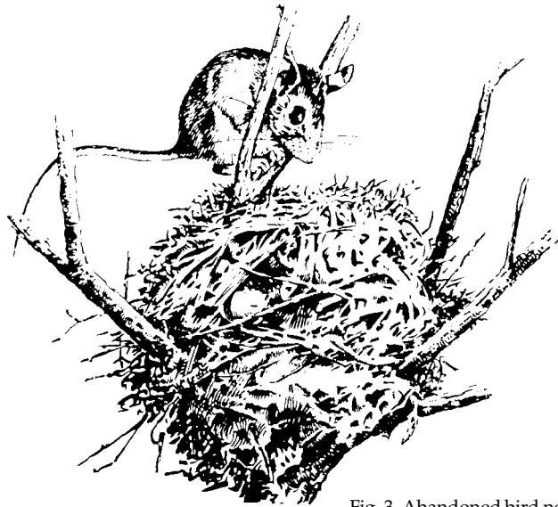
Fig. 3. Abandoned bird nests are frequently roofed and converted into white-footed mouse ( P. leucopus ) homes.

White-footed mice spend a great deal of time in trees. They may use aban-