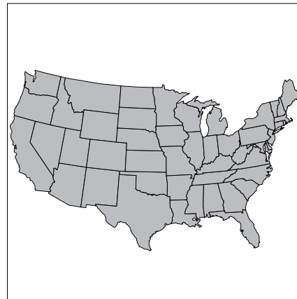
Fig. 2. Approximate distribution of roof rats (a) and Norway rats (b) in the United States.

Some of the key differences between roof and Norway rats are given in Table 1. An illustration of differences is provided in figure 2 of the chapter on Norway rats.