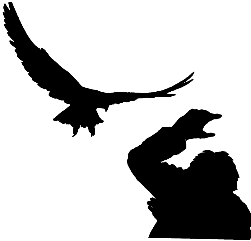
Fig. 2. During nesting season, Mississippi kites may dive at people who come near their nests.

Most Mississippi kites probably winter in Argentina and Brazil. They often migrate in groups of 20 to 30, and usually arrive at their nesting sites in mid- to late April or early May. Their southward migration generally begins in early September, a few weeks after the young have fledged.