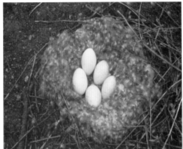
Figure 1. A typical Canada goose nest.

Parents often move their broods to areas chosen for the presence of suitable food, visibility, and proximity to water. Canada geese are grazers and they prefer lawn grass in urban areas. They tend to choose open areas with few obstructions to give them views of potential predators. Conover and Kania (1991) found that, in Connecticut, all