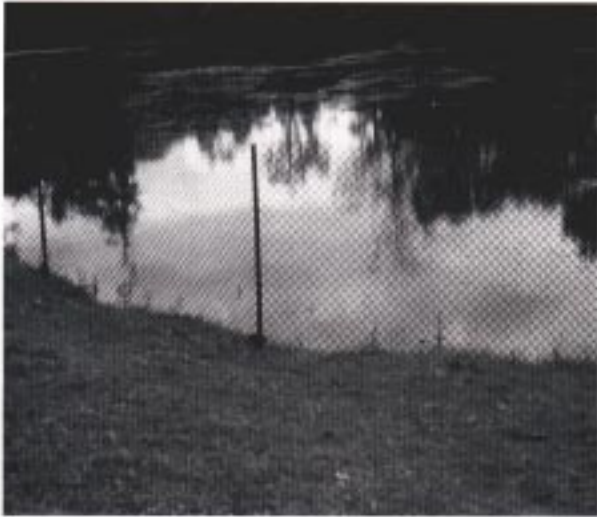
Figure 4. Barrier fencing used during summer molting periods.

, the fence should be at least 30 inches tall, and it should be long enough to discourage the geese from walking around the ends. Fences are most effective during the prenesting period and during flightless periods in early summer when geese have young or are molting. Fencing the perimeter of an area may prevent adult geese and goslings from accessing food sources. The effectiveness of a barrier fence may be enhanced if landscaping modifications are also used.