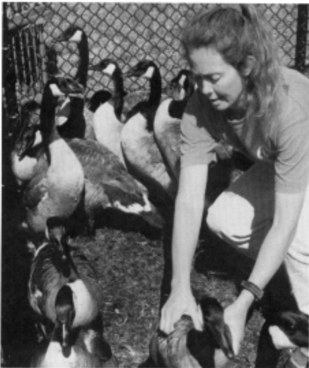
Figure 13. Capturing live geese during a "round-up."

In Toronto, Canada, seven years of egg removal reduced the local population from 1,000 to 600 geese because adults continued to be killed by hunting and other causes (Addison and Amernic 1983). Seventy-two percent of the nests that contained wooden or hard-boiled eggs continued to be incubated for an average of 38 days. Although only two replacement eggs were put into the nests, few geese laid more eggs, resulting in only one gosling hatching from 39 nests (Wright and Phillips 1991).