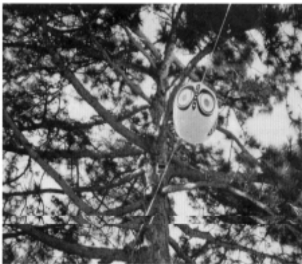
Figure 10. "Eye-spot" or "scare-eye" balloon.

This design has several variations: (1) 6-foot x 30-inch mylar strips on 4-foot stakes, (2) 2-x-3-foot poly sheeting on 6-foot poles, (3) colored mesh vegetable bags filled with straw and suspended from 10-foot poles placed at an angle to permit the bag to swing free, and (4) a pole with a crosspiece at the top with a garbage bag draped and stapled to the crosspiece (the "garbage bag scarecrow"). "Eye-spot" or other balloons or kites: "Eye-spot" or "scare-eye" balloons are large, beach ball-sized, thick-skinned balloons that have been used to scare geese in some situations ( Figure 10 ). Eye-spots elicit a flight response from several species of birds (Inglis 1980). Experiments on the effectiveness of eye-spots (Inglis et al. 1983) found that