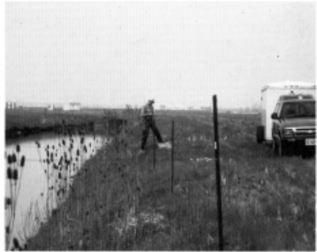
Figure 3. Grid-wire system to prevent geese from landing in ponds.

Grid systems can also be used over land because they prevent flying geese from landing. An alternate feeding