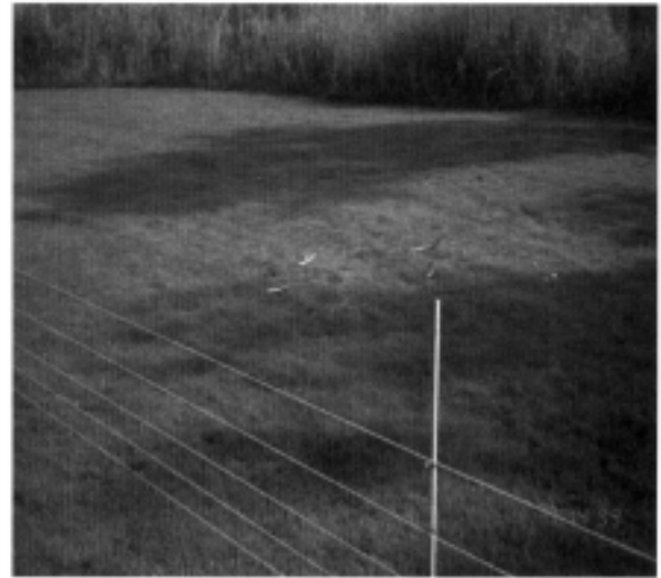
Figure 6. Fence made from monofilament lines.

Wide plantings (20 to 30 feet long and at least 30 inches tall) are more likely to be successful than narrower ones. In extensive plantings, mowed or cleared serpentine footpaths prevent the geese from having a direct line of sight through the planted area, yet still provide shoreline access for humans. A low-maintenance prairie planting or a wildflower area along the shoreline may reduce goose use of the property. Natural meadows have been used as an alternative plant barrier, although seasonally flooded meadows along water areas in Wisconsin have been found