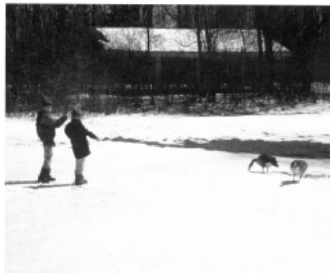
Figure 2. People feeding geese.

The basic principles of habitat modification include eliminating, modifying, or reducing access to areas that