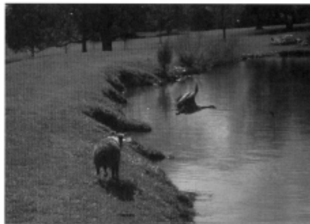
Figure 11. Trained dog scaring a goose.

Once dog harassment has ended, the geese may quickly reestablish themselves near pretreatment numbers (Swift 1998). By federal law, dogs cannot be allowed to catch or harm geese. During midsummer when the birds are flightless, dogs should be leashed to prevent them from capturing the geese. The use of dogs to harass geese may require a state permit. Local leash laws should also be consulted before dogs are used.