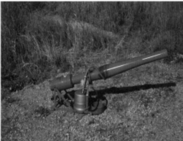
Figure 8. Propane cannon.

A single exploder is effective for 10 to 50 acres depending on conditions and the landscape. Cannons that rotate randomly on detonation may minimize habituation by geese. Two single exploders set to trigger at different intervals (e.g., one every 10 minutes, one every 7 minutes) are more effective than a single cannon. The sound produced by an exploder has been intensified by attaching an open ended drum to the muzzle end of the exploder, thus redirecting and amplifying the sound (Bird and Smith 1963), although this may be contrary to the manufacturers' instructions or void any warranty. Propane exploders work best when used with other techniques such as flagging or scare balloons. Combining a cannon with a moving human silhouette carrying a gun will increase the effectiveness of both techniques (Wright 1963).