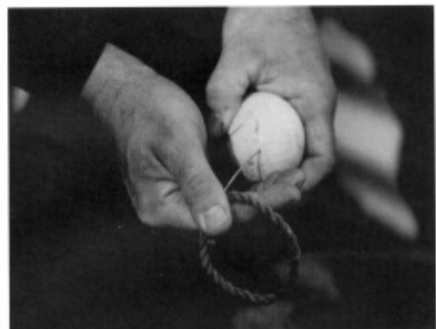
Figure 12. Egg puncturing to reduce production of young geese.

Many oils are effective in reducing the success of hatching (Baker et al. 1993, Christens et al. 1995, Pochop et al. 1998). Only 100 percent food grade, corn oil is exempt from U.S. Environmental Protection Agency regulations in the United States, however, and this is the only oil that may be used to treat eggs (Federal Register, Wednesday, March 6, 1996, 66 (45): 8876-8879). Mineral oil (Daedol 50 NF) is registered as an avicide in Canada and may be used to treat eggs there. Christens et al. (1995) found that spraying mineral oil on eggs either early or late in incubation prevented 100 percent of eggs from hatching. In Britain, eggs treated with liquid paraffin did not hatch (Baker et al. 1993). The paraffin did not affect the plumage of the nesting adults, nor did the geese make any attempts to form a second nest after the first nest failed. The liquid paraffin appeared to enter the egg's surface quickly, and subsequent